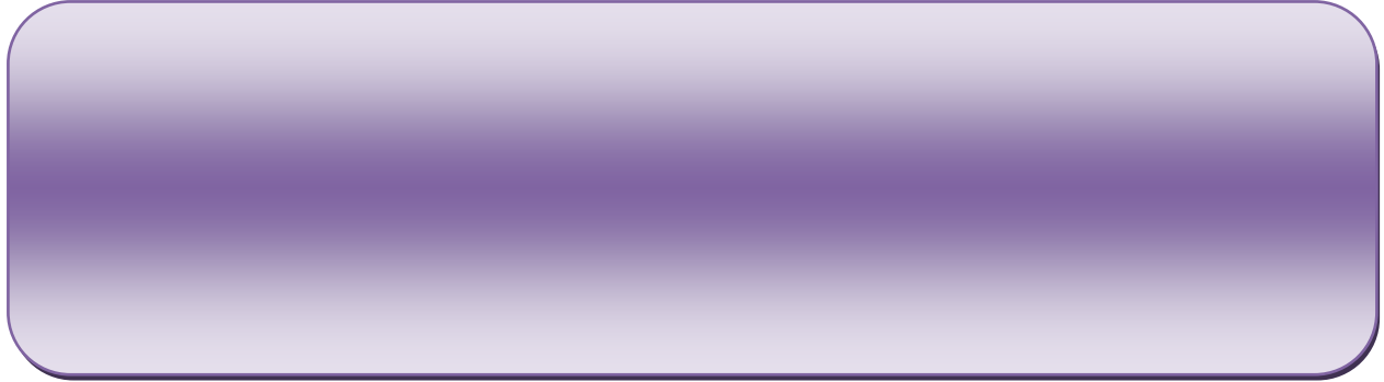
Table 6. Additional Items

Four items measured additional components of school climate (Table 6).