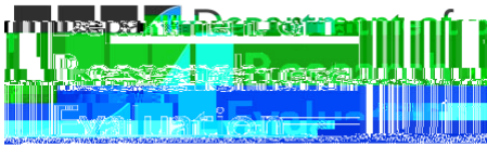
Figure 2. Number of AISD Students Taking the ACT